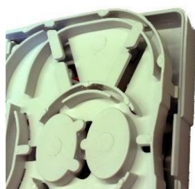
Subscriber socket CTB2-A