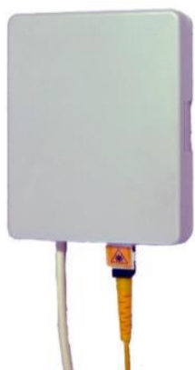
Subscriber socket CTB2-A

Socket CTB2-A are designed as a termination point of subscriber's fiber optic line.