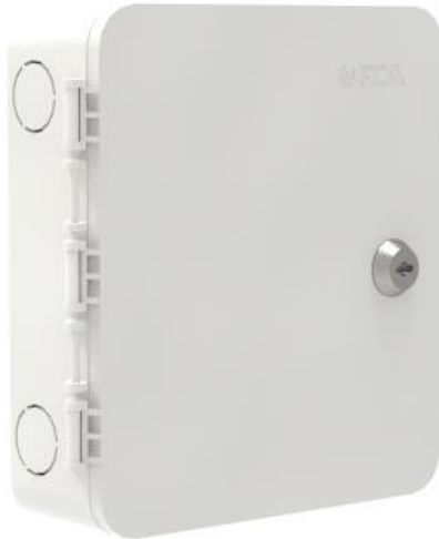
Fiber Optic Splice Box INCO

Fiber Optic Splice Box for FTTH indoor applications.